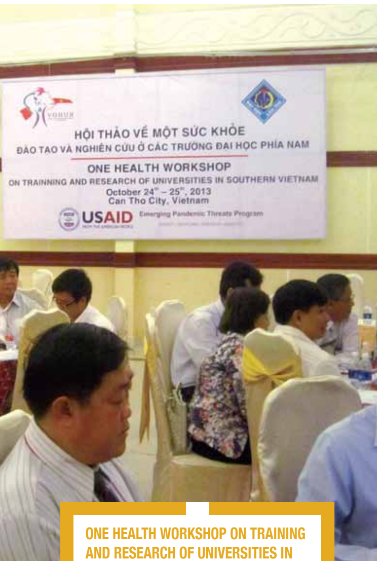
ONE HEALTH WORKSHOP ON TRAINING AND RESEARCH OF UNIVERSITIES IN SOUTHERN VIETNAM, CAN THO, OCTOBER 24-25, 2013

The OH workshop was held involving multiple faculties in Southern Vietnam to discuss and strengthen understanding of OH and the OH approach to control emerging infectious diseases. The workshop was part of an effort to facilitate coordination of One Health curriculum development within a regional network in Vietnam. Under tight collaboration between VOHUN and Can Tho University, the organized workshop aims to introduce One Health's knowledge on training and research of universities in Southern Vietnam and to extend the One Health network in both Medical and Veterinary universities, colleagues and institutes in this region. The target audiences of the workshop were lecturers/ researchers/ government staffs of institutions, government organizations which offer programs of human medicine and veterinary in Vietnam or involve in zoonotic diseases prevention.