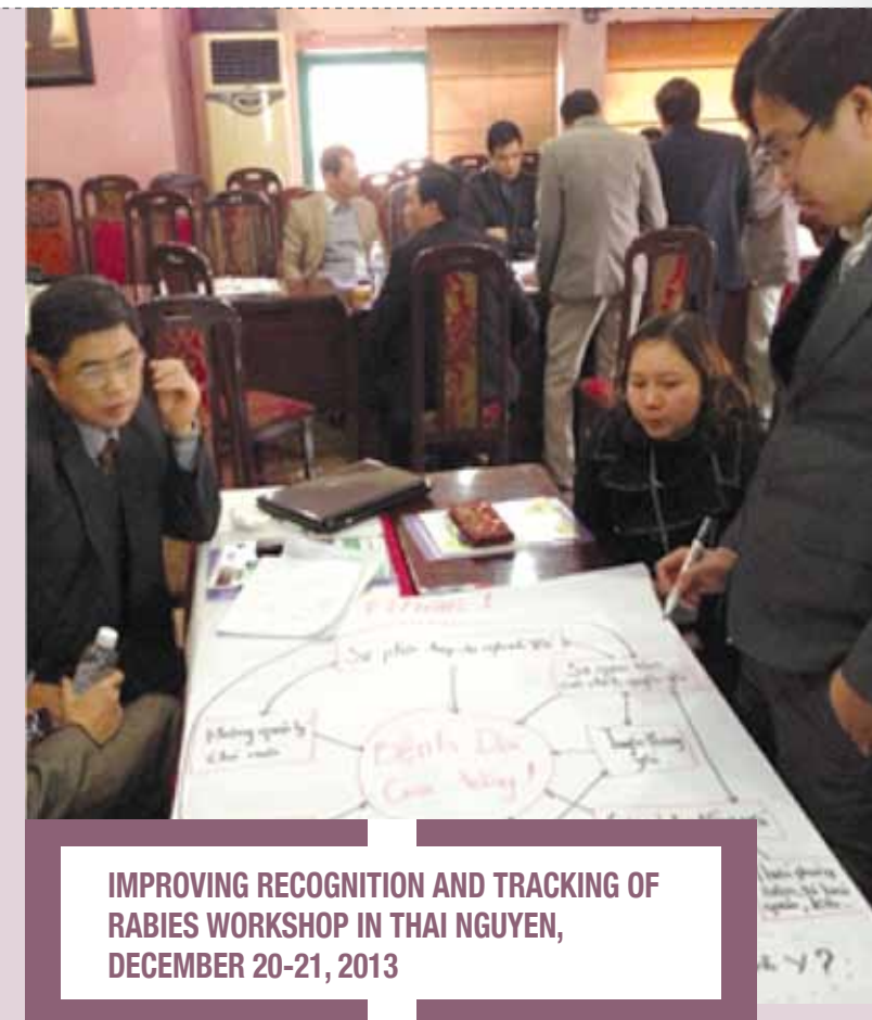
IMPROVING RECOGNITION AND TRACKING OF RABIES WORKSHOP IN THAI NGUYEN, DECEMBER 20-21, 2013

The Thai Nguyen area is a part of Vietnam where the rabies prevalence seems to be quite high compared to the rest of the country. Currently, there is no standardized curriculum for training either medical or veterinary students on rabies prevention and control. We brought research and teaching professionals from Ministry of Health, Ministry of Agriculture and Rural Development, Institutes and Universities to Thai Nguyen province to discuss developing a rabies curriculum for medical and veterinary students as well as creating a health education program for local human and animal health professionals on rabies. The workshop objectives were understanding the rabies situation in Thai Nguyen and Tuyen Quang provinces; proposing an integrated rabies curriculum for medical and veterinary students at Thai Nguyen universities; and developing a case study on Rabies for use in One Health educational activities .